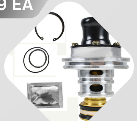
KE22105 AD-IS PURGE VALVE $35.89 EA