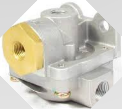
K289714 QUICK RELEASE VALVE $24.89 EA