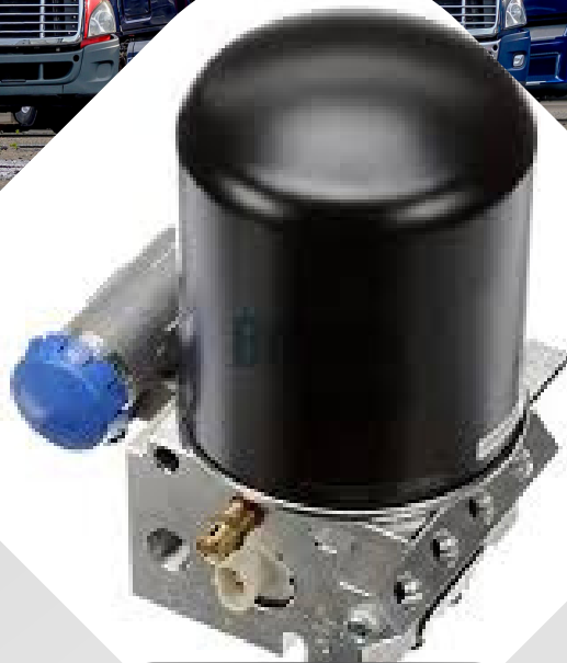
K801266 AIR DRYER $225.89 EA